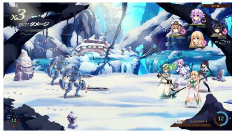
*Japanese Screenshots not final